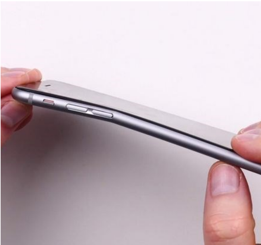
The new iPhone bends under pressure.